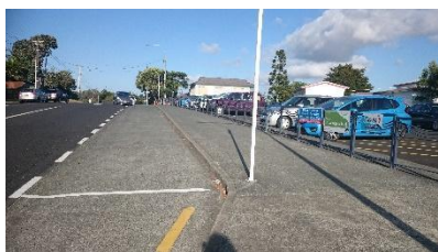
Drop off/Pick up area

Whether you walk or come by car, if you need to cross a road near our school you must cross at one of the school crossings.