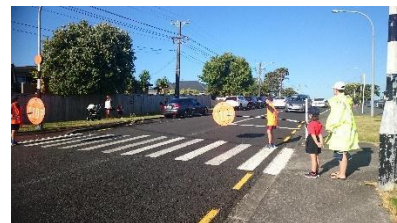
Signs out - wait