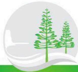
Personal Excellence Tu Rangatira