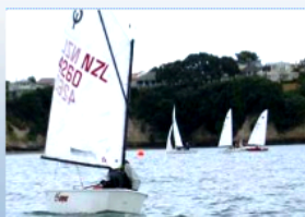
Yr 5/6 Waterwise