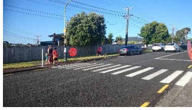
Wait at the crossing