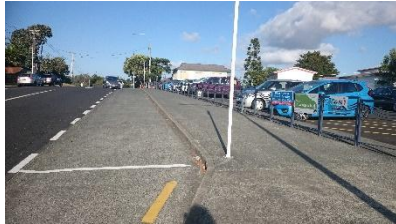
Drop off/Pick up area