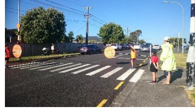
Signs out - wait