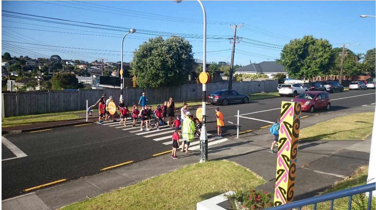
Cross now. Cross at the crossing only.

Any Problems? - If you have any problems or worries at school you can of course always talk to your teacher about them. She will always try to help you. You may also come and talk to me. I am in the ESOL room.