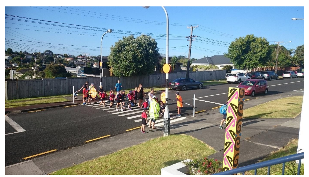
Cross now. Cross at the crossing only.

Any Problems? - If you have any problems or worries at school you can of course always talk to your teacher about them. She will always try to help you. You may also come and talk to me. I am in the ESOL room.