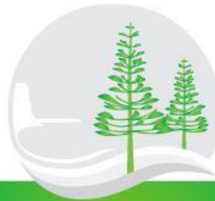
Personal Excellence Tu Rangatira