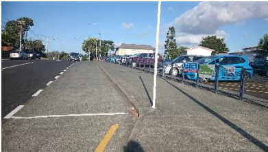
Drop off/Pick up area

Whether you walk or come by car, if you need to cross a road near our school you must cross at one of the school crossings.