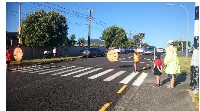
Signs out - wait