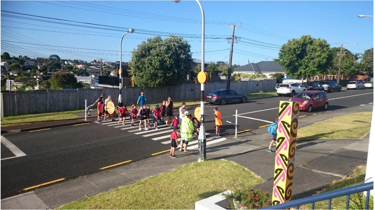
Cross now. Cross at the crossing only.

Any Problems? - If you have any problems or worries at school you can of course always talk to your teacher about them. She will always try to help you. You may also come and talk to me. I am in the ESOL room.