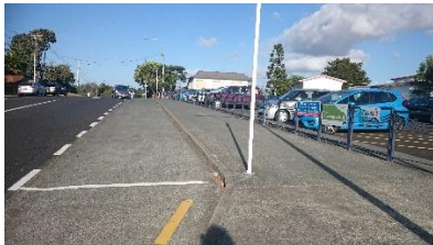
Drop off/Pick up area