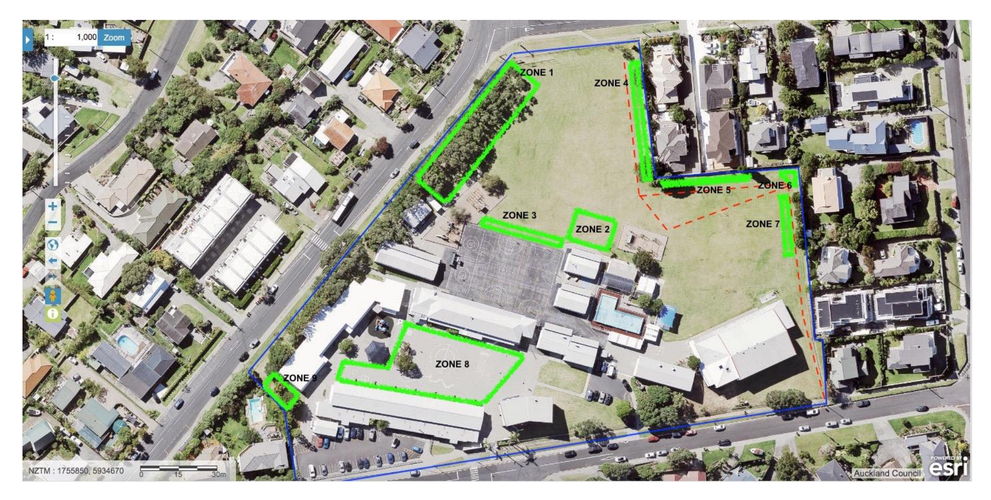
Figure 1: Green Zones KEY: Stormwater Drains — — — —